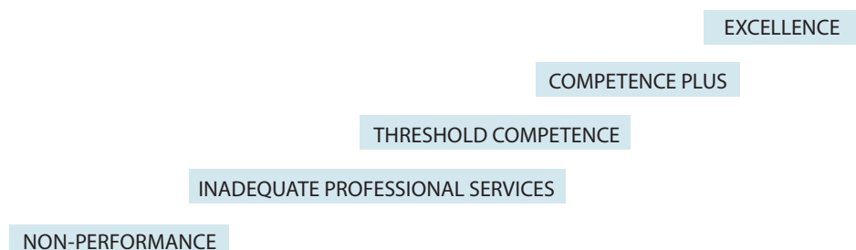
Figure 1. The Quality Continuum 192

From the notion that quality was either black or white, it became recognized that it was a continuum from non-performance up to excellence. In the days when “quality” was used synonymously with “excellence”, quality was seen as a binary concept, it had either been attained or it had not. In modern times it has become accepted that, in fact, quality is a continuum: